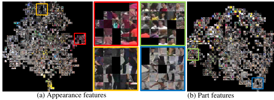
Fig. 3. The t-SNE visualization of the normalized local appearance and part descriptors on the Market-1501 dataset. It illustrates that our two-stream network decomposes the appearance and part information into two streams successfully. (a) Appearance descriptors are clustered roughly by colors, independently from the body parts where they came from. (b) Part descriptors are clustered by body parts where they came from, regardless of the colors. (Best viewed on a monitor when zoomed in)

As a result, the image similarity does not depend on the relative positions of parts in images, and therefore the misalignment problem is reduced. To make the local part similarity to be always non-negative and therefore the sign of the local similarity depends only on the sign of the local appearance similarity, we can also restrict the part descriptors \mathbf{p}_{xy} to be element-wise non-negative by adding a ReLU layer after the part map extractor \mathcal{P} as shown in Figure 2. As this variant results in similar accuracy to the original one, we used the model without the ReLU layer for all the experiments. See supplementary material for more details.