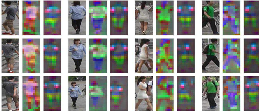
Fig. 4. Visualization of the appearance maps \mathbf{A} and part maps \mathbf{P} obtained from the proposed method. For a given input image (left), appearance (center) and part (right) maps encode the appearance and body parts, respectively. For both appearance and part maps, the same color implies that the descriptors are similar, whereas different colors indicate that the descriptors are different. The appearance maps share similar color patterns among the images from the same person, which means that the patterns of appearance descriptors are similar as well. In the part maps, the color differs depending on the location of the body parts where the descriptors came from. (Best viewed in color)