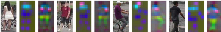
Fig. 5. Comparing the body part descriptors. For a given image (left), the conventional joint-based (center) and the proposed (right) descriptors are visualized. (Best viewed in color)

pose the appearance and part information into two streams: one stream corresponds to the appearance maps and the other corresponds to the body part maps.