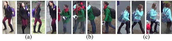
Fig. 1. (a, b) As a person appears in different poses/viewpoints in different cameras, and (c) human detections are imperfect, the corresponding body parts are usually not spatially aligned across the human detections, causing person re-identification to be challenging.

appears in a similar pose within a tightly surrounded bounding box. Thus, a body part-aligned representation, which can ease the representation comparison and avoid the need for complex comparison techniques, should be designed.